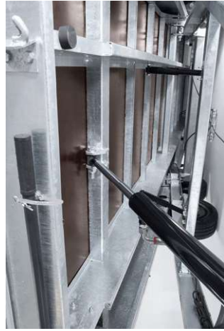
Special stability due to double hat profiles in transverse direction on the bridge